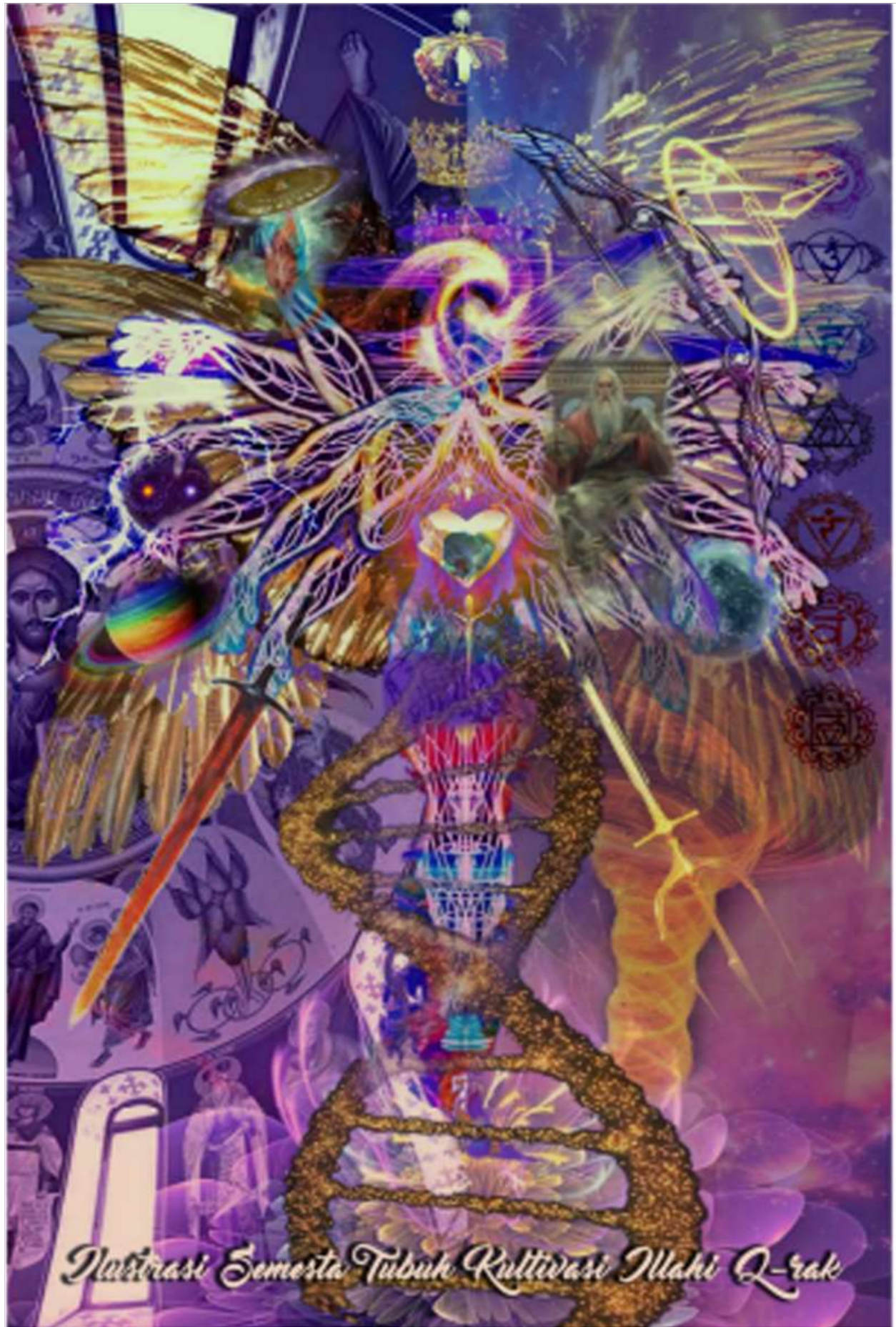
Ilustrasi Semesta Tubuh Kultivasi Illahi Q-rak